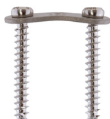
O-Plate with screws

The Delta Plate is offered in 4 sizes with 2 screw holes per plate.