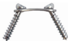
Delta Plate with screws